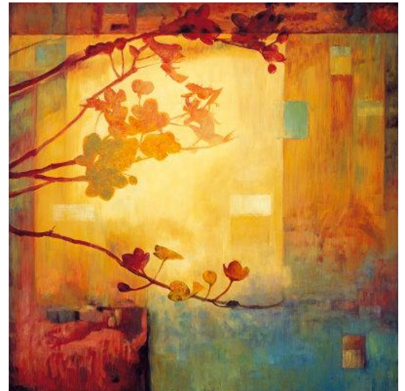
“RENEWAL” BY ERIN LANGE